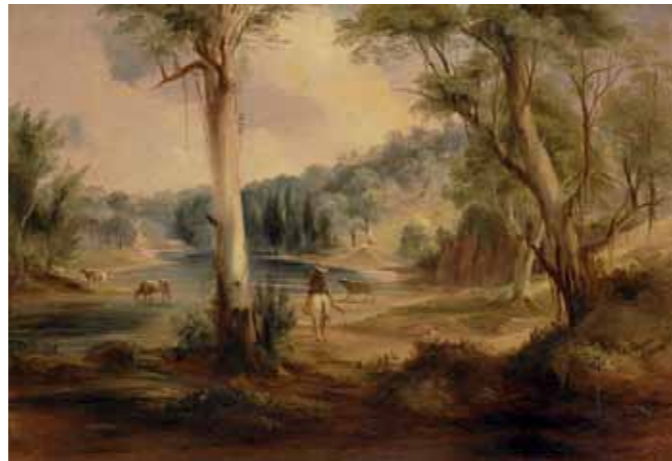
Conrad Martens born England 1801, arrived Australia 1835, died 1878 Ford at the Wollondilly , 1839, oil on wood panel, 46.9 x 67.2 cm