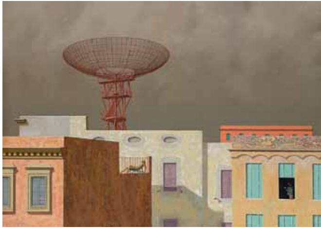
Jeffrey Smart born Australia 1921, lived in Italy 1965–, Rooftops , 1968–69, oil on canvas, 71.6 x 100.4 cm © Courtesy of the artist