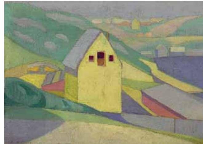
Roy de Maistre born Australia 1894, lived in England 1928-68, died England 1968 (Syncromy, Berry's Bay) , 1919, oil on plywood, 25.4 x 35.2 cm © Courtesy of the artists estate