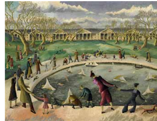
Peter Purves Smith Australia 1912-49 ( The pond, Paris ) c.1938, oil on canvas, 71.7 x 92.0 cm